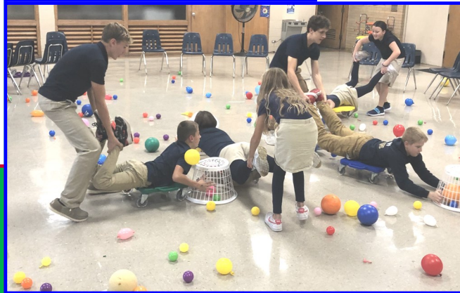
Kids having fun playing Human Hungry Hippo!