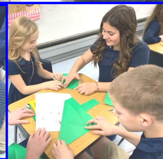
Just a reminder we have "gently" used uniforms at the school. There are several sizes to choose from. Please feel free to come in and take a look.