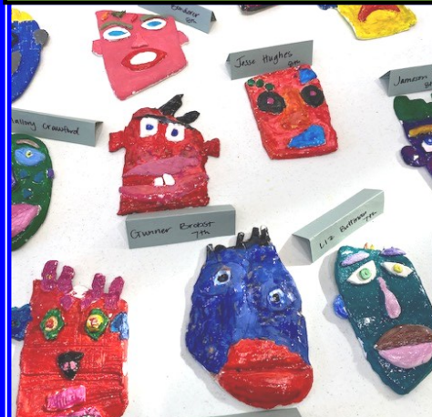
Some of our students made paper mache mask that were displayed at the Cultural Corner Art Show.